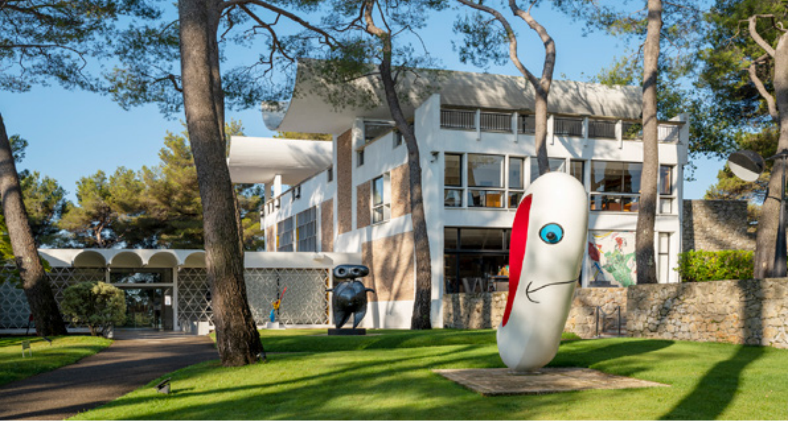
Fondation Maeght façade and garden