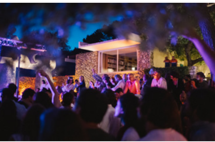
Concert in the Miró labyrinth

Drawing on this rich heritage, Fondation Maeght is back to hosting numerous events in the fields of music, film, poetry, writing and soon dancing.