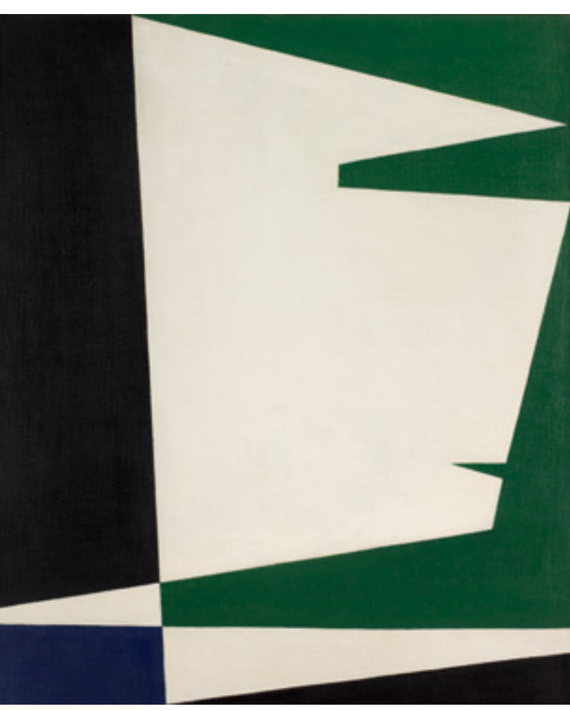
Jo Delahaut, Clostra, 1950, Oil on canvas, 100.5 \times 80.7 cm © Photo credit: Fondation Gandur pour l'Art, Genève. Photographer: André Morin © ADAGP, Paris 2022