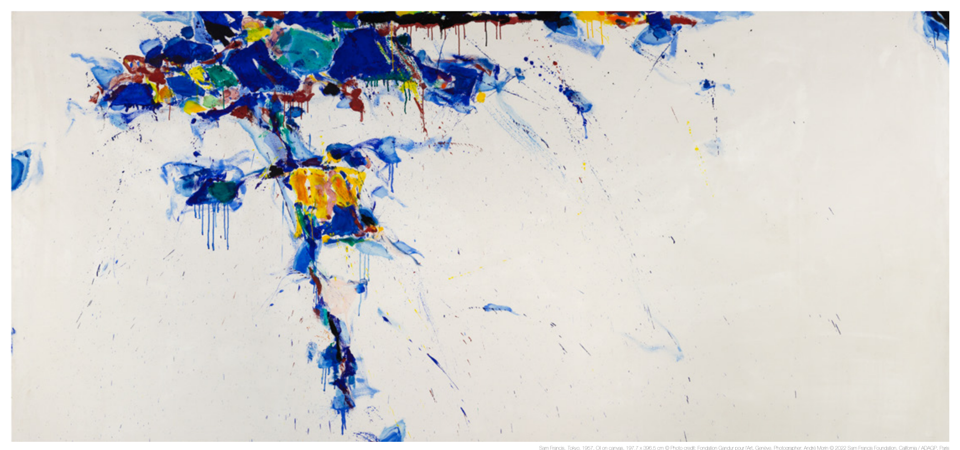
Sam Francis, Tokyo, 1957, Oil on canvas, 197.7 x 396.5 cm