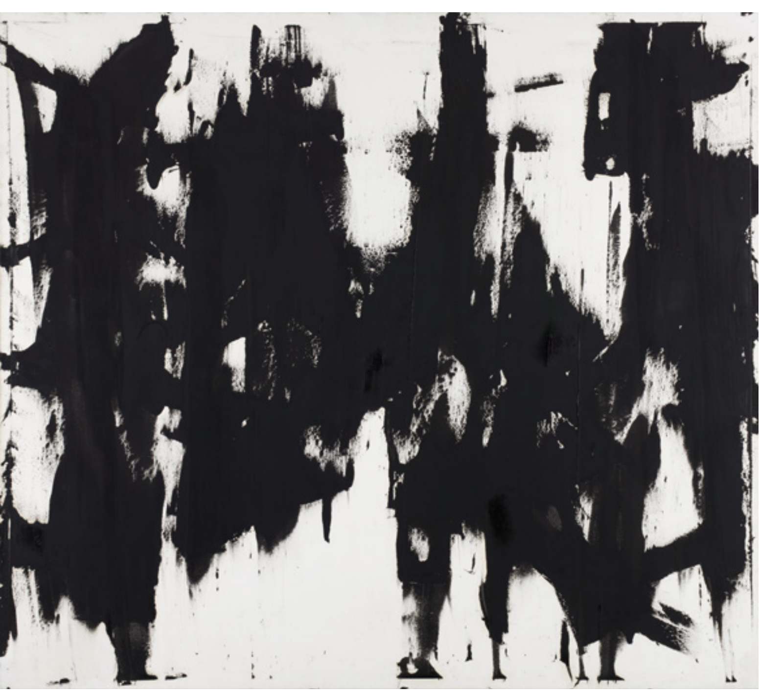
Judit Reigl, Les Huns (Mass Writing serie), 1964, Oil on carvas, 207.5 x 230.5 cm