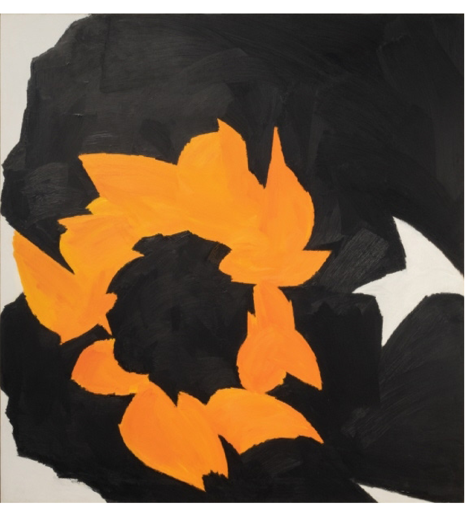
Jack Youngerman, Tiger, 1961, Oil on canvas, 221.3 x 236.8 cm © Photo credit: Fondation Gandur pour l'Art, Genève. Photographer: André Morin © ADAGP, Paris 2022.