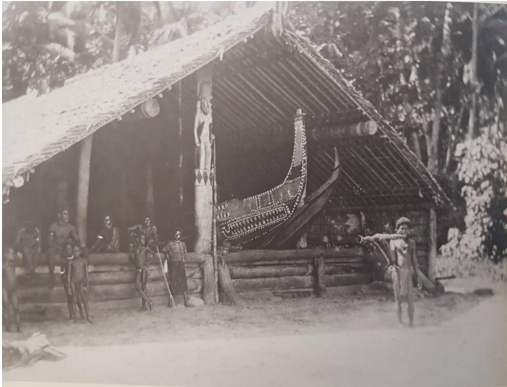
Fig. 3: Aofa of Gupuna