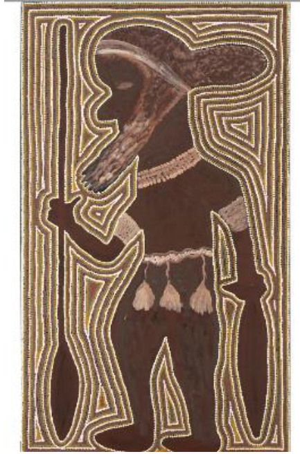
Fig. 1: Turkey Tolson Tjupurrula (c. 1942-2002), My Father, the Mitukatjirri Warrior, 1997 Synthetic polymer on linen canvas