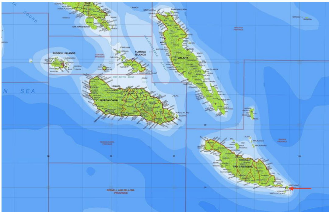
Fig. 2: Map of the south-eastern Solomon Islands