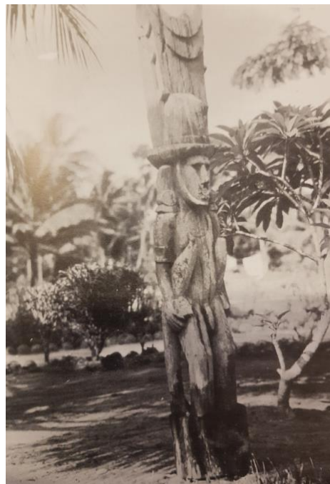
Fig. 5: The statue in 1933 © After Byer, Die Grosse Insel , p. 91, fig. 19. Photographer: Hugo Bernatzik