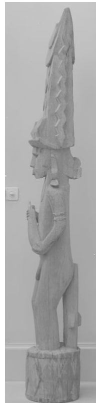
Fig. 10 et 11 : Poteau de faitage, Vb 7446, Bâle, Museum der Kulturen © Museum der Kulturen Basel, Vb 7446; collection Eugen Paravicini; photograph by Peter Horner