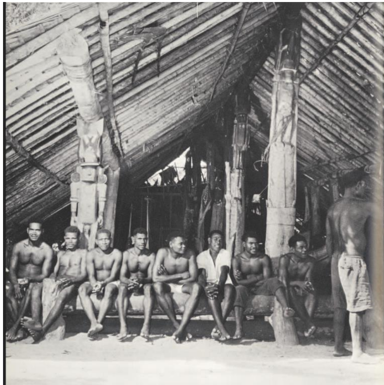
Fig. 7: Aofa of Natagera © After Davenport, "Sculpture", p. 14.