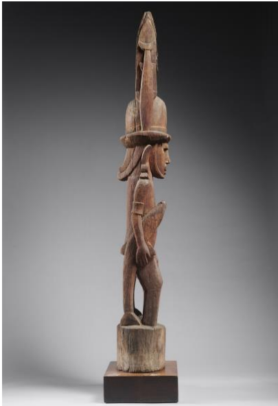
Fig. 8: Ridge post FGA-ETH-OC-0082